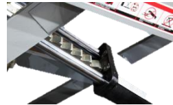
Safety Locking Device