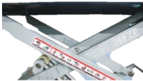
Strengthened Support Arm